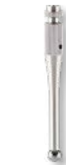
Probe tip long Art-No. 00163D006