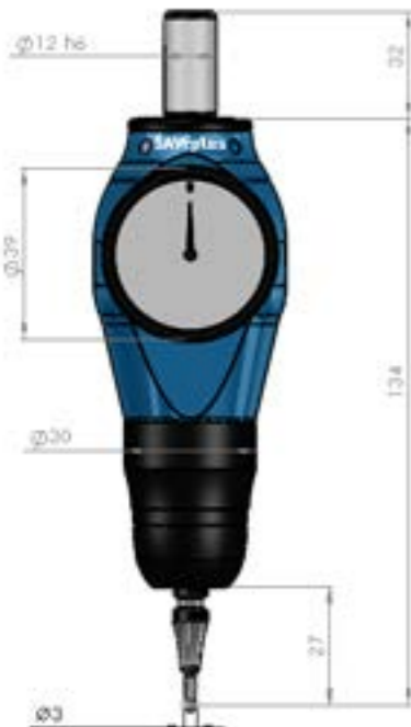
3D-Tester SAVEplus Art-No. 00163B012