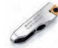
BBIT72 80°粗搪孔刀座 80° Cutting Insert Holder for BBIT Adjustable Twin Cutter Roughing