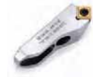
BBIT72 45°正反倒角粗搪孔刀座 45° Chamfer Cutting Insert Holder for BBIT Adjustable Single Cutter Roughing