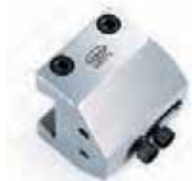
BBIT72 大孔徑粗搪孔本體 Body for Large Diameter Adjustable Twin Cutter Roughing