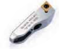
BBIT72 粗搪孔反搪刀座 Reverse Cutting Insert Holder for BBIT Large Diameter Adjustable Single Cutter Roughing