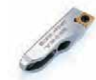
BBIT72 粗搪孔刀座 Cutting Insert Holder for BBIT Large Diameter Adjustable Twin Cutter Roughing