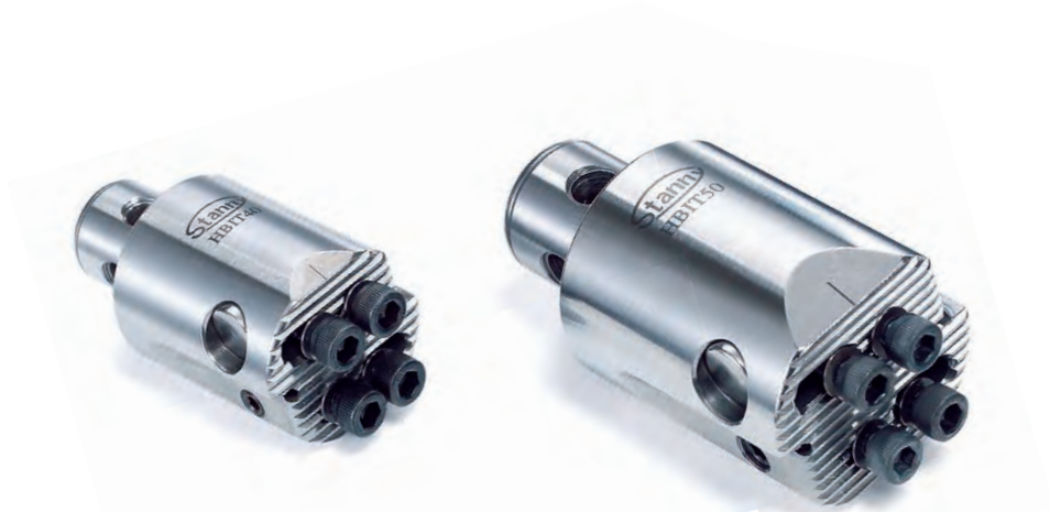
HBIT 雙刃粗搪孔刀-本體 Body for HBIT Adjustable Twin Cutter Roughing