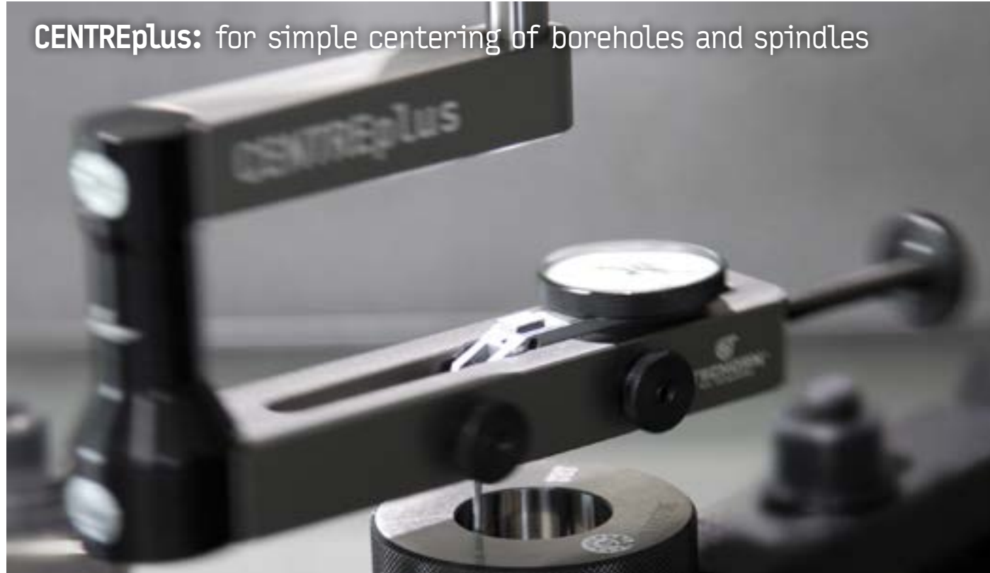
CENTREplus: for simple centering of boreholes and spindles